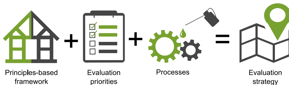
Figure 1 Elements of an Indigenous Evaluation Strategy

The Indigenous Evaluation Strategy should (figure 1):